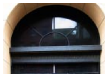
Dark bar below window reads Lee Kohns Cultural Arts Center