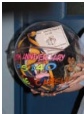
50 th anniversary time capsule

Following the pledge, the third grade classes presented a skit called, "Then and Now." Then the Nathan Straus statue was brought on-stage by two representatives of the fifth grade students who created it. The sixth graders created tenement books which looked like tenement houses. Each student did the artwork on his/her own book and wrote a poem which was read during their presentation.