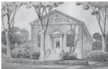
Illustration of what Straus Library will look like from Milton Graduate Bulletin June 1928