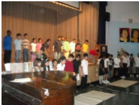
The students of PS 140 at the 50th anniversary ceremony