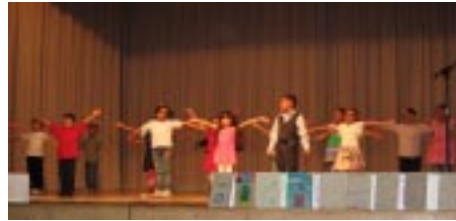
"Let It Be" performed by the first and second grade classes. Tenement books can be seen in the foreground