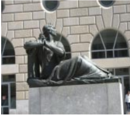
One of two sculptures that is part of the Oscar S. Straus Memorial

Oscar S. Straus Memorial in Washington DC was dedicated by President Harry S. Truman in 1947. The proposal to honor