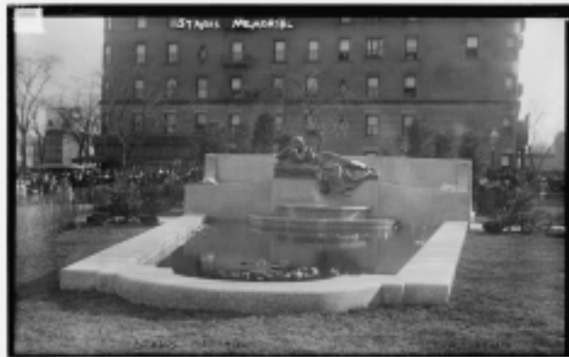
Above: Early Library of Congress photograph of Straus Park