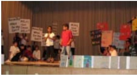
Then & Now skit presented by the third graders

descendants. Many had questions. It became clear very quickly that everyone at the school knew who Nathan Straus was and were pleased to be associated with an institution that honored his memory.