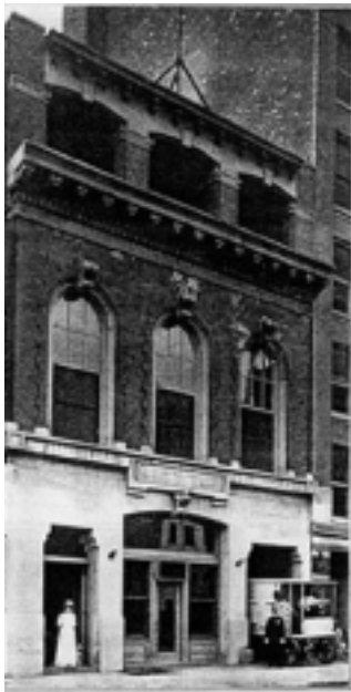
Nathan Straus Milk Laboratory, Later Nathan Straus Children's and Young Adult Library 348 East 32 nd Street, NYC