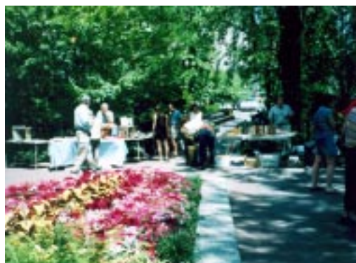
Below: Book Fair at Straus Park