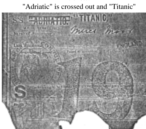
"Adriatic" is crossed out and "Titanic"