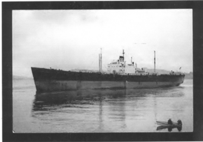
Liberty Cargo Ship - Oscar S Straus

The "Oscar S. Straus" was sold to private operators in 1947 and scrapped in 1970.