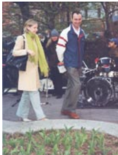
Left: Representatives from Opus