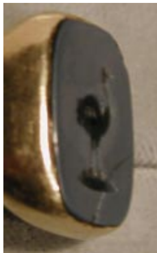
Left: Gent's Ostrich Ring, side view Below: Gent's Ostrich Ring