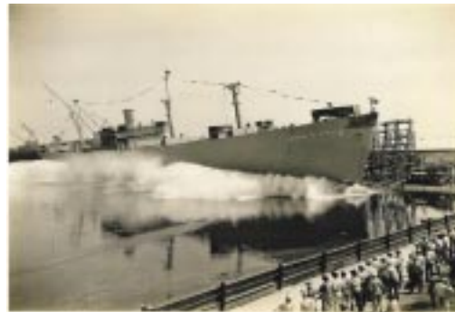
Launch of the "Oscar S. Straus"

The "Oscar S. Straus" was sold to private operators in 1947 and scrapped in 1970.